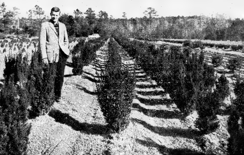
Taxus media Hatfieldi. Photo Dec. 18, 1957.

THUJA or. (Biota) aurea nana . Berkman's Golden Arborvitae. Very fine specimens.